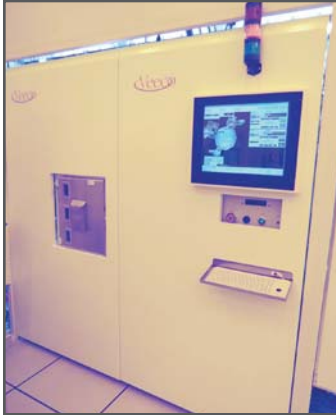
Veeco IBD/IBE (Ion Beam Deposition & Etch) w/CX6C2 Metal Film PVD Sputtering System w/Etch Mill Module