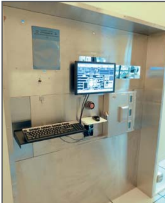
Veeco Model 350/C2 Metal Film Removal System