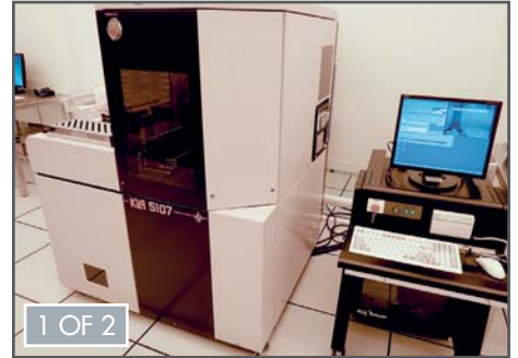
Kla-Tencor Model 5107 XP Track w/Width Measurement Systems