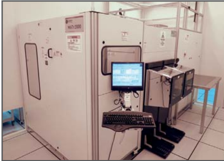
TEL Magnetic Solutions Magnetic Annealing Oven