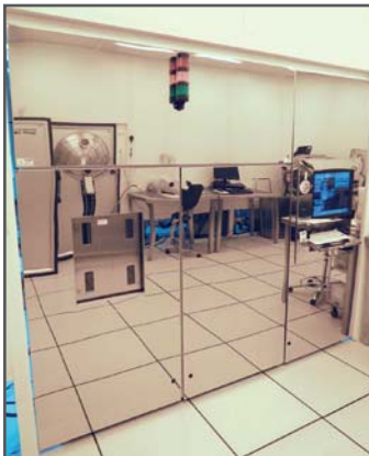
Veeco VCE.PVDI C-2 PVD Metal Film PVD Sputtering System