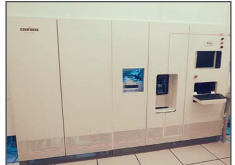
Alcatel-MeVac Comptech Model 620B Metal Film PVD Sputtering System