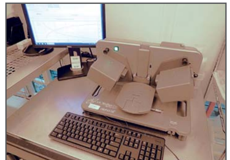
J.A. Wollman Co. Ellipsometer