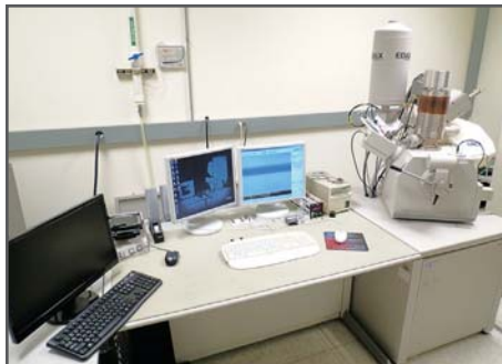
Philips XL40 Scanning Electron Microscope