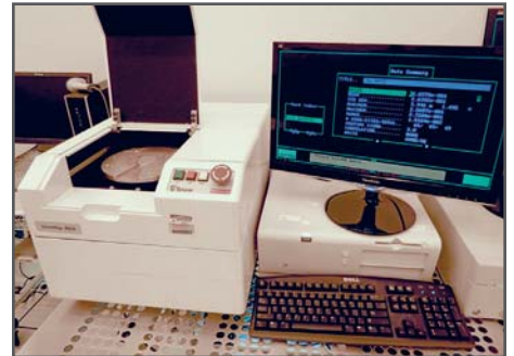
Tencor Model OmniMap RS75 Film Thickness Measurement System