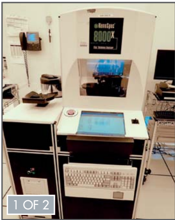
Nanometrics NanoSpec 8000X Model 7000-0493 Rev-P1 Film Thickness Analyzer/Measurement Systems