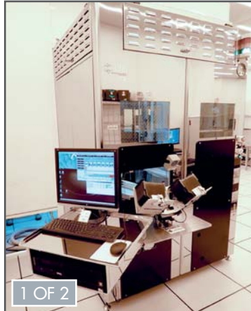
Solid State Equipment Corp. (SSEC 3300) Photo Resist Removal and Wafer Cleaning Machines