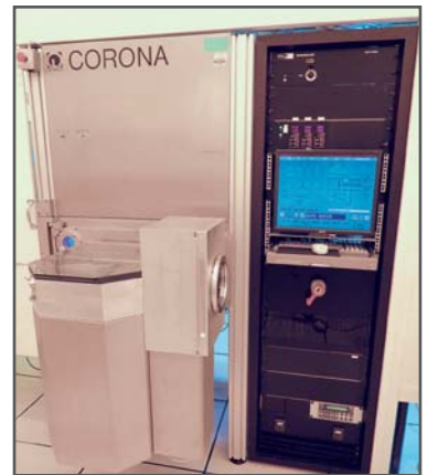
Leybold Corona Metal Film PVD Sputtering System

VISIT OUR WEBSITE FOR COMPLETE AUCTION DETAILS