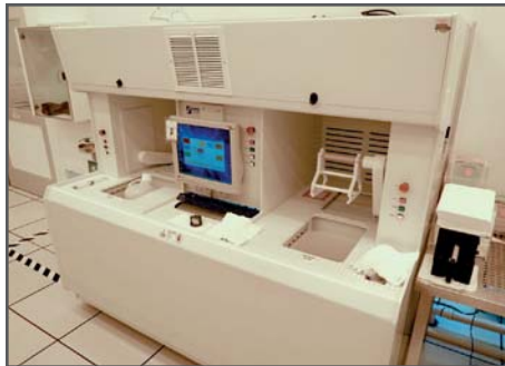
Numerous Plating & Wet Benches