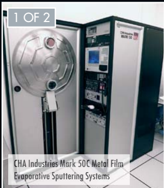
Photo-Lithography, Vacuum Deposition, Thin Film Plating & Etching, Quality Control, Engineering, Test, & Facility Support

Multi-Million Dollar 6" Semi-Fab Operation – Complete Closure of a 65,000 Sq. Ft. Facility