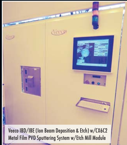
Veeco IBD/IBE (Ion Beam Deposition & Etch) w/CX6C2 Metal Film PVD Sputtering System w/Etch Mill Module