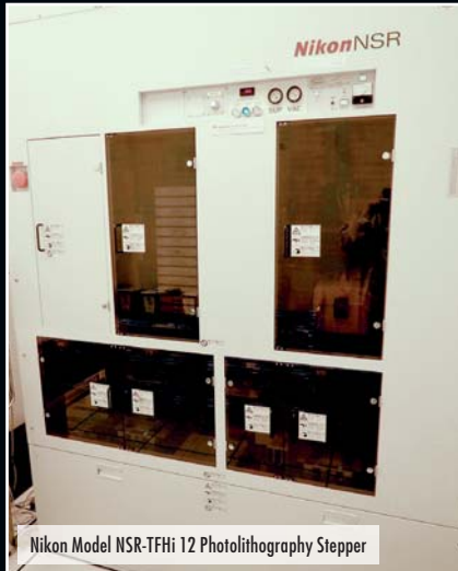
Nikon Model NSR-TFHi 12 Photolithography Stepper

1450 Infinite Drive Louisville, Colorado 80027