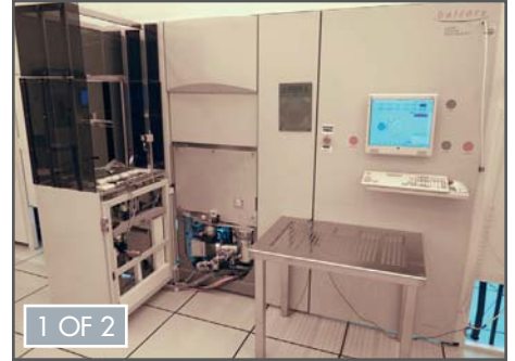
Unaxis Balzers Model LLS 502 Load Lock Metal Film PVD Sputtering Systems