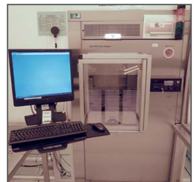
Philip PANalytical Model 2830 XRF Wafer Analyzer X-Ray Measurement System