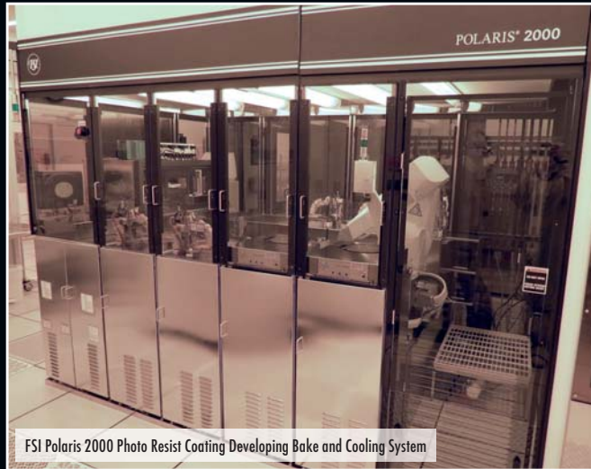
FSI Polaris 2000 Photo Resist Coating Developing Bake and Cooling System