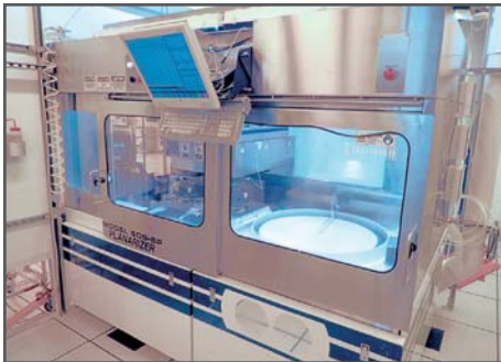
Strasbaugh Model 6DS-SP Planarizer Chemical Mechanical Polishing System