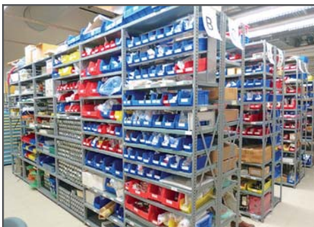
Massive Spare Parts Inventory, Over $4,000,000 in Cost