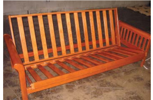
NUMEROUS FUTON COUCHES & MATTRESSES