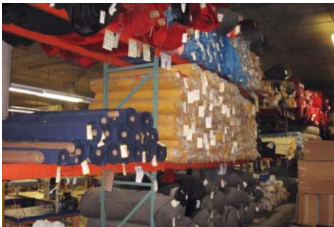
VIEW OF FABRIC ROLLS