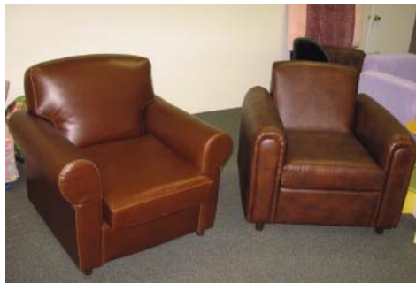
ASSORTMENT OF LEATHER CHAIRS & RECLINERS