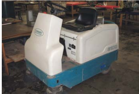
TENNANT MODEL 6100 36V FLOOR SCRUBBER