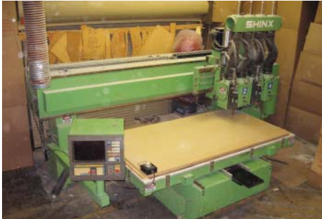
HENDRIKSAW MODEL 20000 SHINX 4-SPINDLE WOOD /ALUMINUM CNC ROUTER