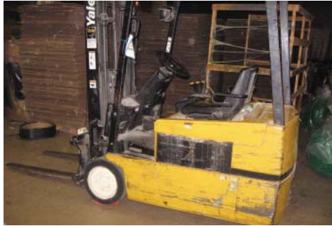
YALE 4000LBS ELECTRIC FORK LIFT