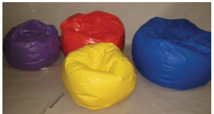
HUNDREDS OF FINISHED BEAN BAG CHAIRS & BEAN BAG SKINS W/O STUFFING