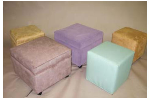
SEVERAL VARIETIES OF OTTOMANS