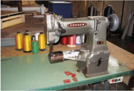
CONSEW MODEL 227R SEWING MACHINE