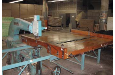
UNITED AUTOMATIC LT TUFTING MACHINES