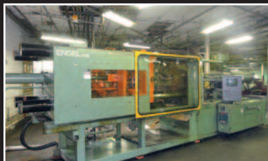
ENGEL 450 TON INJECTION MACHINE ('90)