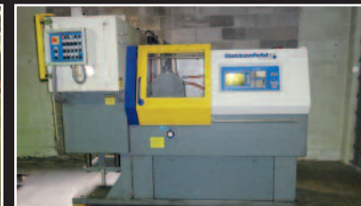
BATTENFELD BA500 V-V-S VERTICAL INJECTION MOLDER