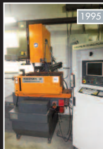
1995 CHARMILLES TECHNOLOGIES MODEL ROBOFORM 20 EDM, S/N 210210