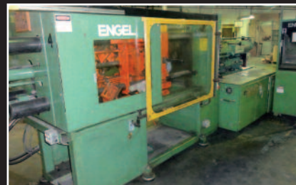
ENGEL 175 TON INJECTION MOLDER ('87)