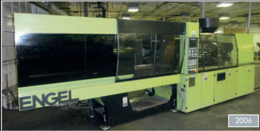
ENGEL 240 TON TIEBARLESS INJECTION MACHINE

VISIT THE ONLINE PHOTO GALLERY TO VIEW OVER 100 IMAGES