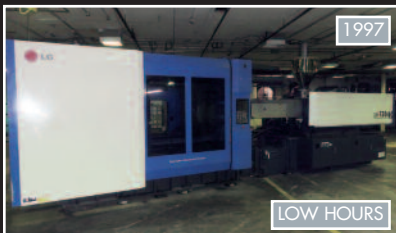
LG LGH 720M, 720 TON INJECTION MOLDER