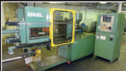
ENGEL 80 TON INJECTION MOLDER ('84)