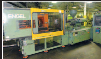
ENGEL 275 TON INJECTION MOLDER ('84)

See complete terms & conditions on our website. Please Note: items and quantities in this brochure are subject to prior sale. View the lot catalog online prior to the auction for the complete and final offering.