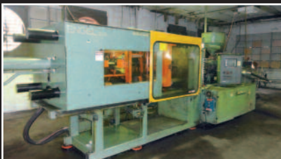
ENGEL 300 TON INJECTION MACHINE ('90)